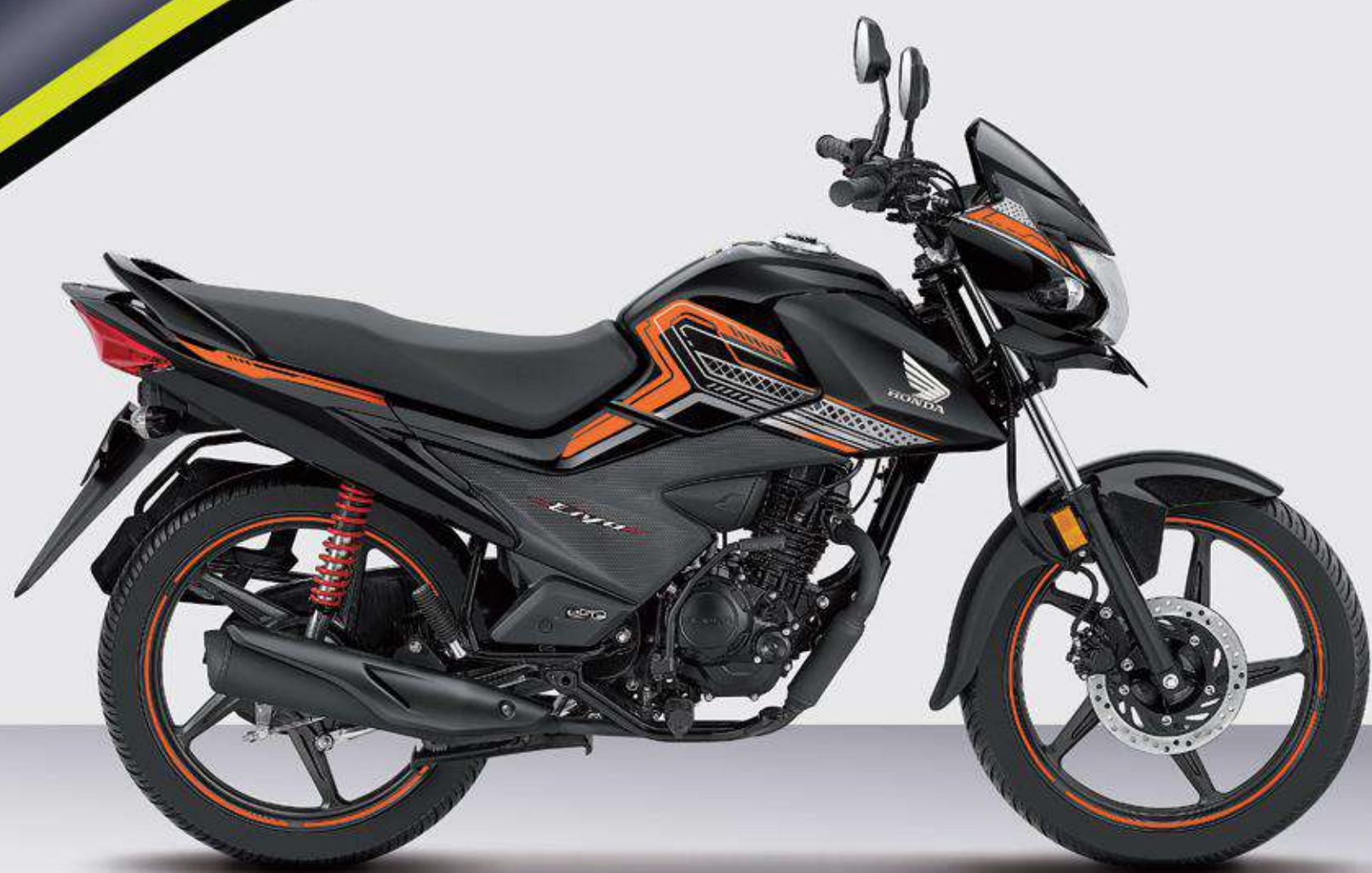
PEARL IGNEOUS BLACK (Pearl Igneous Black Shroud + Orange Stripes)