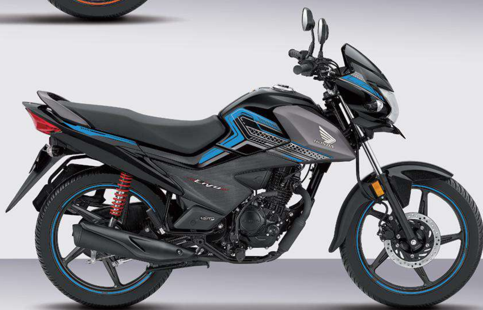
PEARL IGNEOUS BLACK (Geny Gray Shroud + Blue Stripes)