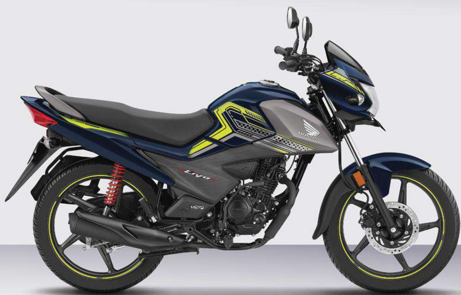
PEARL SIREN BLUE A (Geny Gray Shroud + Green Stripes)