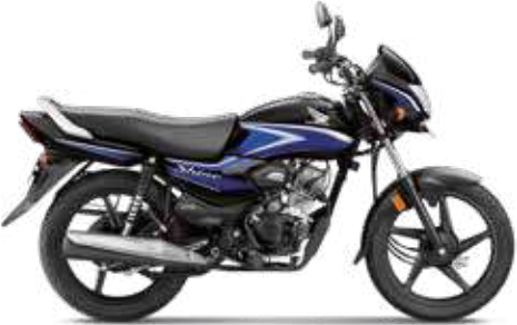
Black With Blue