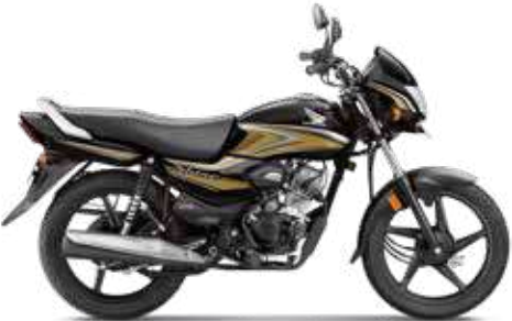
Black With Gold