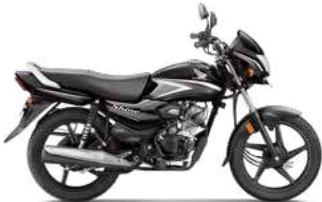
Black With Grey

BOOK ONLINE NOW! www.honda2wheelersindia.com