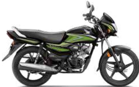
Black With Green